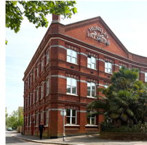
HUNTLEY & PALMERS (H)