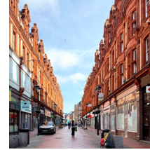
QUEEN VICTORIA ST (F)