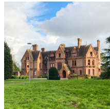
FOXHILL HOUSE (R)