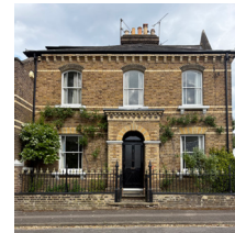
THE MOUNT (T)