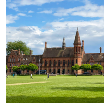
READING SCHOOL (K)