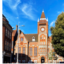
TOWN HALL (A)