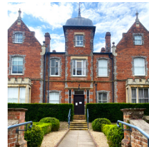
WHITEKNIGHTS HOUSE (S)