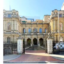
ASSIZE COURTS (B)