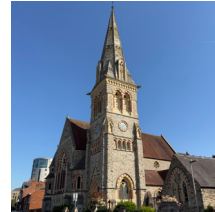
ST JOHN EVANGELIST (J)