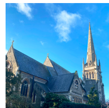
CHRIST CHURCH (W)