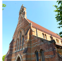
ST BARTHOLOMEW'S (M)