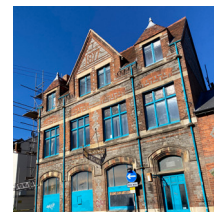
RISING SUN (Y)